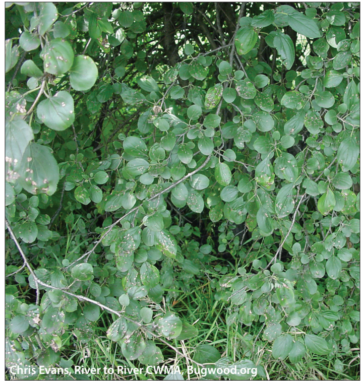
Chris Evans, River to River CWMA, Bugwood.org

Common buckthorn twigs often have thorns at their tips, between the terminal buds. Branches are dotted with light-colored vertical raised marks. The bark is brown to gray and peels with age. The inner bark is orange.