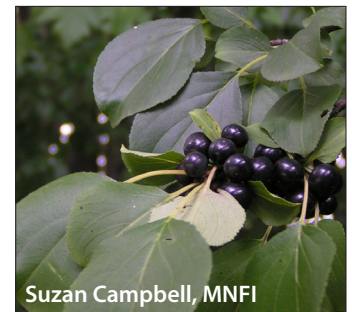
Suzan Campbell, MNFI

Common buckthorn has abundant small, round fruits that ripen from green to purplish black. They are only produced on female plants but have high germination rates. Unripe fruits contain emodin, which has a laxative effect.